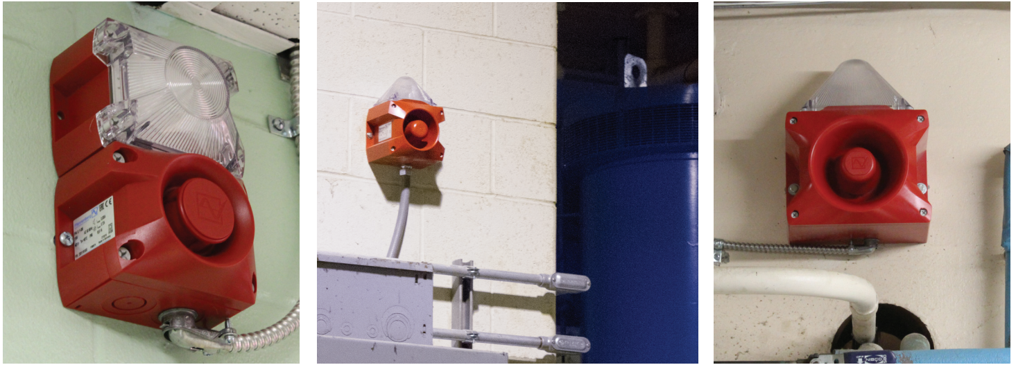
Pfannenber Signaling Products Installed throughout Wastewater Treatment Plant for Gas Detection Application